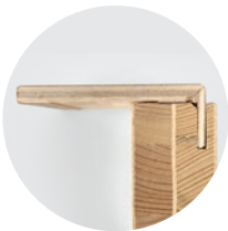
Blockboard frame, plywood casing