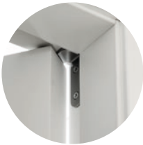
Invisible pivot hinges satin chrome finish