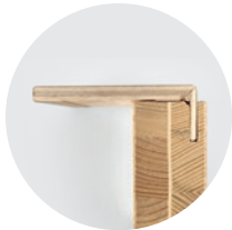
Blockboard wood frame, multilayer wood cover profiles.