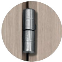
Anuba hinges chrome finish